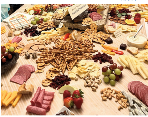
A masive and fun charcuterie table