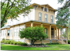
Preserving North Wood County history since 1952

Fill out form below and mail or apply online using Historical Society Web Site.