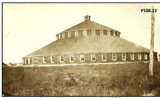
Round Barn circa early 1920s

2016 is the 100 year anniversary for the Marshfield Clinic and the Round Barn