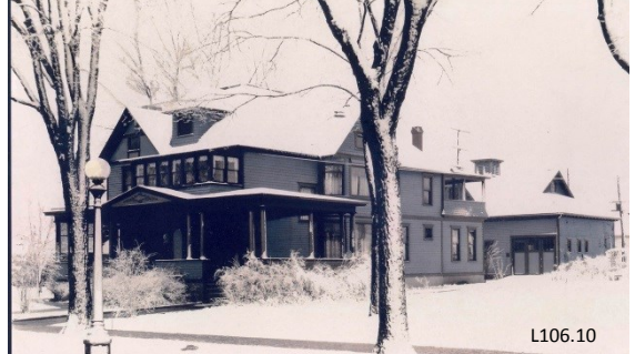
C.E. Blodgett sold this house to Emma Uthmeier in 1923. table was huge and seated 12 or 14 people. There was a small powder room to the north side.

trance to the back. The first room, or vestibule, was huge and had a coat rack and umbrella holder, and a small closet for coats. The next room was the music room which had a beautiful baby-grand piano. When I sat there to play on it I felt like a queen! The room was divided by pillar posts to the formal living room which had a beautiful fireplace, and then was open on the other side to the formal dining room. All meals were served here. The