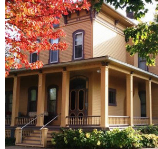
Upham House Museum