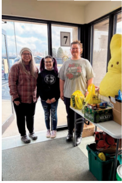
Food delivery day to United Way's NOW program, St. Vincent de Paul, and Soup or Socks food pantries.