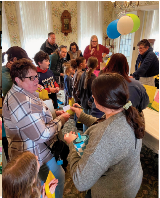
Five minutes until guess the number of jelly beans in the jar closes. Only $1 a guess.